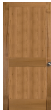
WESTERN RED CEDAR*