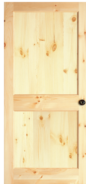
EASTERN WHITE KNOTTY PINE*