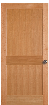
QUARTERSAWN RED OAK*