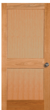
QUARTERSAWN WHITE OAK*